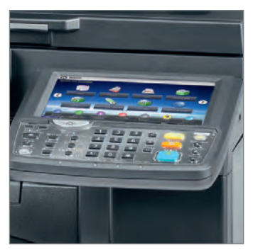
Easy to use colour touch panel