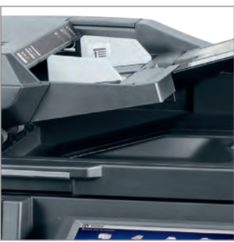
Choice of three document feeders: 50 sheets / 100 sheets / 175 sheets with single-pass Dual -Scan