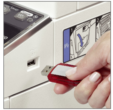
DIRECT SCANNING TO USB MEMORY STICK