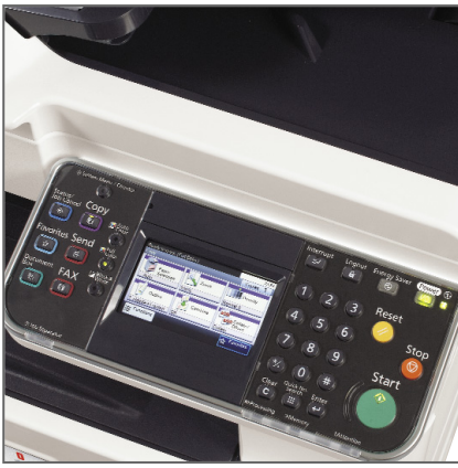
OPERATOR PANEL with 4.3" touch screen