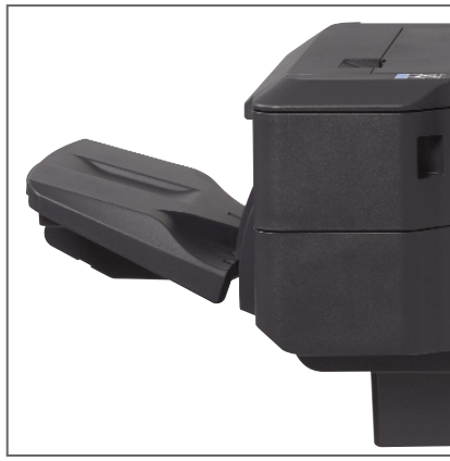
500-sheet EXTERNAL FINISHER (optional)