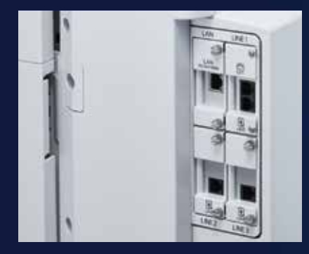
Optional second ethernet and fax line connection

With a second ethernet connection and second fax line (both optional), benefit from increased security.