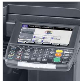
Capacitive 8.5" control panel

The new multifunctional system is also equipped with an internal web browser that grants remote access to websites or servers in order to expedite the printing of documents available on the Internet/Intranet. The same network integration and the ability to manage PDF/A (1a and 1b) and Encrypted PDFs means that the new d-Color MF2552 can be used as a document management enabler system.