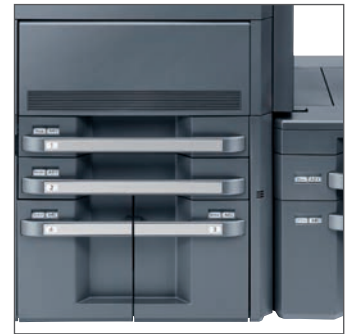
Max. paper tray capacity (with options) 7,650 sheets (7 trays + bypass)