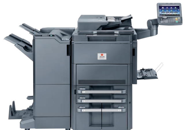
d-Copia 6500MF PLUS