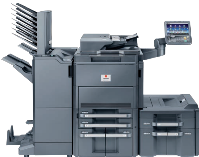
d-Copia 8000MF PLUS