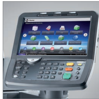
Tilttable operator panel, 10.1" colour touch screen

(Olivetti's Mobile Print App is available for free download)