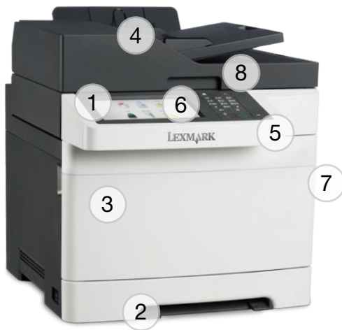
XC2132 with 7-inch colour touch screen